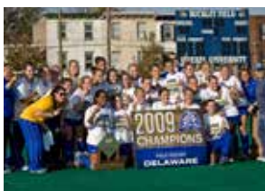
2009 CAA Champions