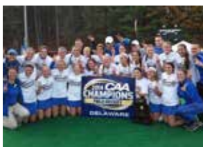
2014 CAA Champions