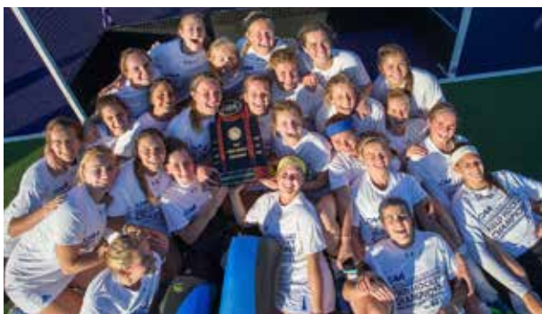
2015 CAA Champions