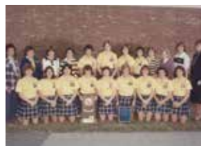
1982 ECC Champions