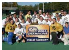
2004 CAA Champions