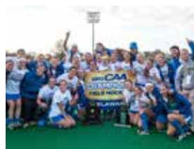
2013 CAA Champions