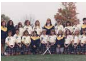
1990 ECC Champions