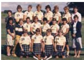
1985 ECC Champions