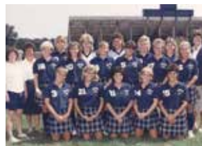
1988 ECC Champions