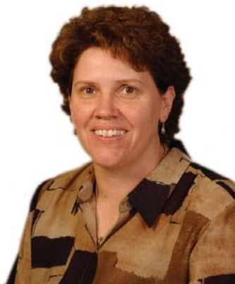
the PSAC's all-time leading scorer with 2,157 career points.