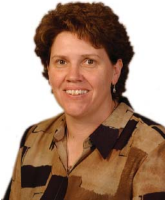
the PSAC's all-time leading scorer with 2,157 career points.